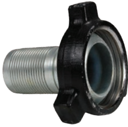
3" and 4"