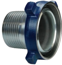
6" and 8"